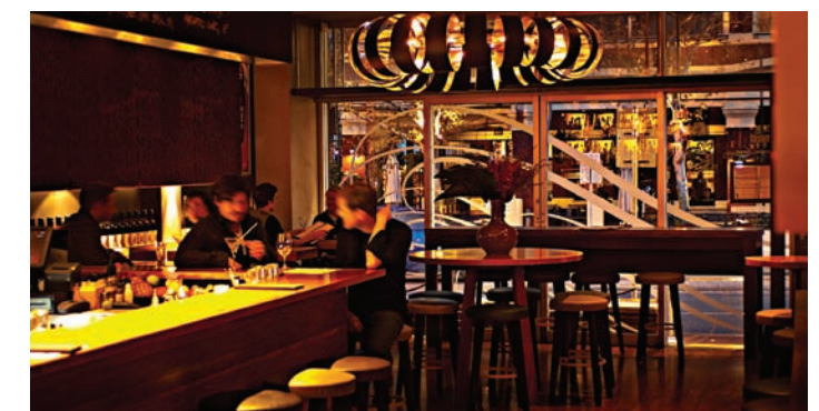
19 Must Winebar

MT LAWLEY, HIGHGATE, NORTHBRIDGE From the tousled nooks of Northbridge and busy line-up of innovative concepts along Beaufort Street to the hip family pockets of North Perth, this inner-city design hub presents an ever-evolving tapestry of culture, old and new. Shaped by a heritage that includes Italian, Chinese, Jewish, Greek and Macedonian, this region brings together some of Perth's best food, bars, boutiques and galleries punctuated by a fascinating blend of Art Deco, Federation, and immigrant nostalgia architecture.