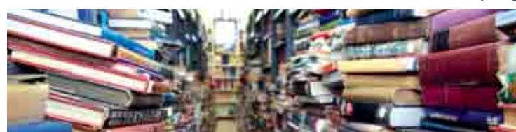
9 Gould's Book Arcade

Don McLean Tuesday 15th February The Enmore Theatre www.enmoretheatre.com.au