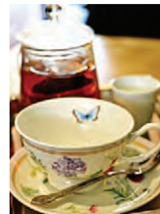
17 The Little Darling Diner C2

26 Kate Owen Gallery B4 Quality contemporary Aboriginal artwork 680 Darling Street. T: 9555 5283 www.kateowengallery.com W to Su 11-6 or by appointment