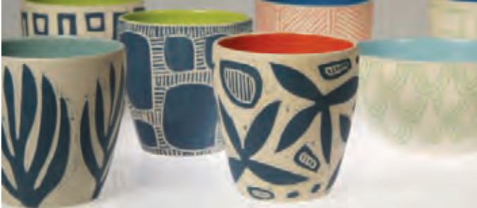
1 Dimity Kidston H2

29 THE ESSENTIAL INGREDIENT 731-735 Darling Street. T: 9555 8300 Free coffee from the espresso bar with any purchase upon presentation of your Urban Walkabout guide. MAP B5